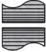
2" Wide Crimp Roll 201-003-K