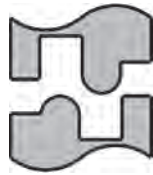
OGEE Roll Set 201-074-K