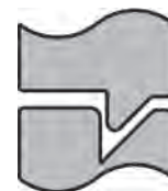
Gore Edge Roll Set 201-054-K