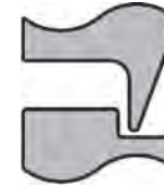
Flange Roll Set 1/4" 201-057-K 3/8" 201-056-K