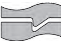
Fire Damper Set 201-055-K