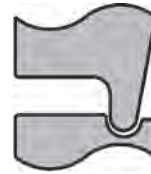
Turning Roll Set 201-053-K