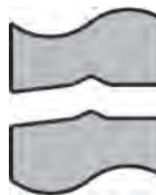
Duct Work "V" Set 201-079-K