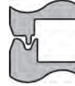
Elbow Edge Set 201-064-K