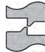
Shear Roll Set 201-058-K