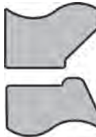
Offset Swedge Set 201-078-K